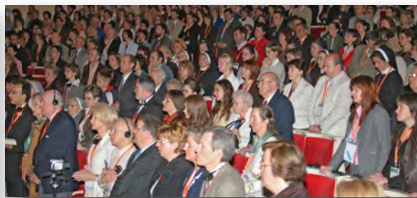
World Congress of Families IV Warsaw, May11-13, 2007