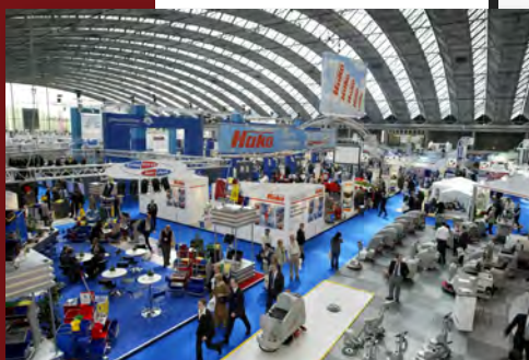
RAI Convention Center exhibit area