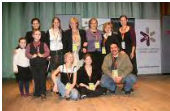
News Room Volunteers